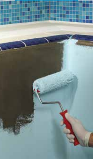
Application of Elastocolor Waterproof with a roller