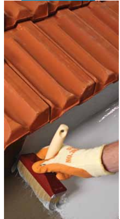
Example of a gutter waterproofed with Mapelastich Smart and coated with Elastocolor Waterproof

All relevant references for the product are available upon request and from www.mapei.com