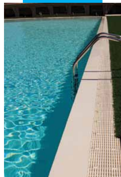
Detail view of a swimming pool dressed with Elastocolor Waterproof